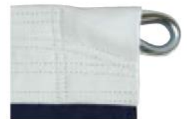
20' x 30' & larger