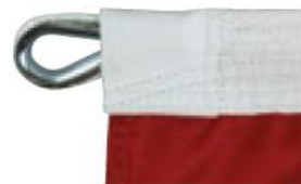
8' x 12' to 15' x 25'