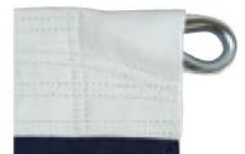
20' x 30' & larger